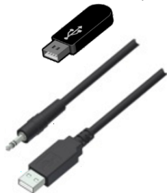
Interface cable USB (type A) to mini connector (3.5 mm) with integrated USB converter l: 1.7 m