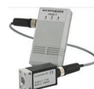
Fig. 3 programming adapter