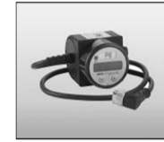
Fig. 4 Programming device P6